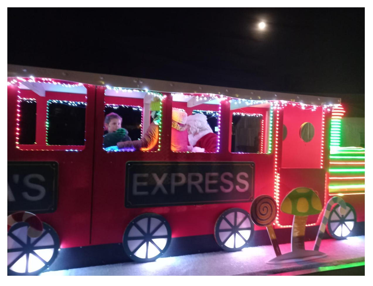
Santa in his train visiting the Risca children