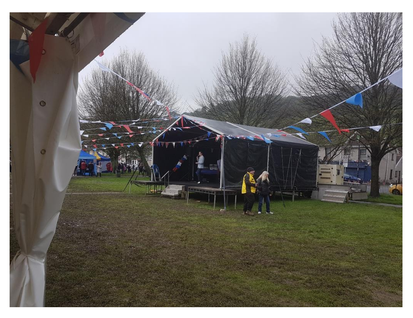
The music stage being readied for the King's Coronation Fare in Tredegar Park, Risca